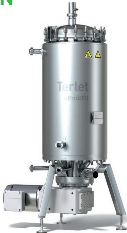
Terlotherm Continuous fast heat exchanger