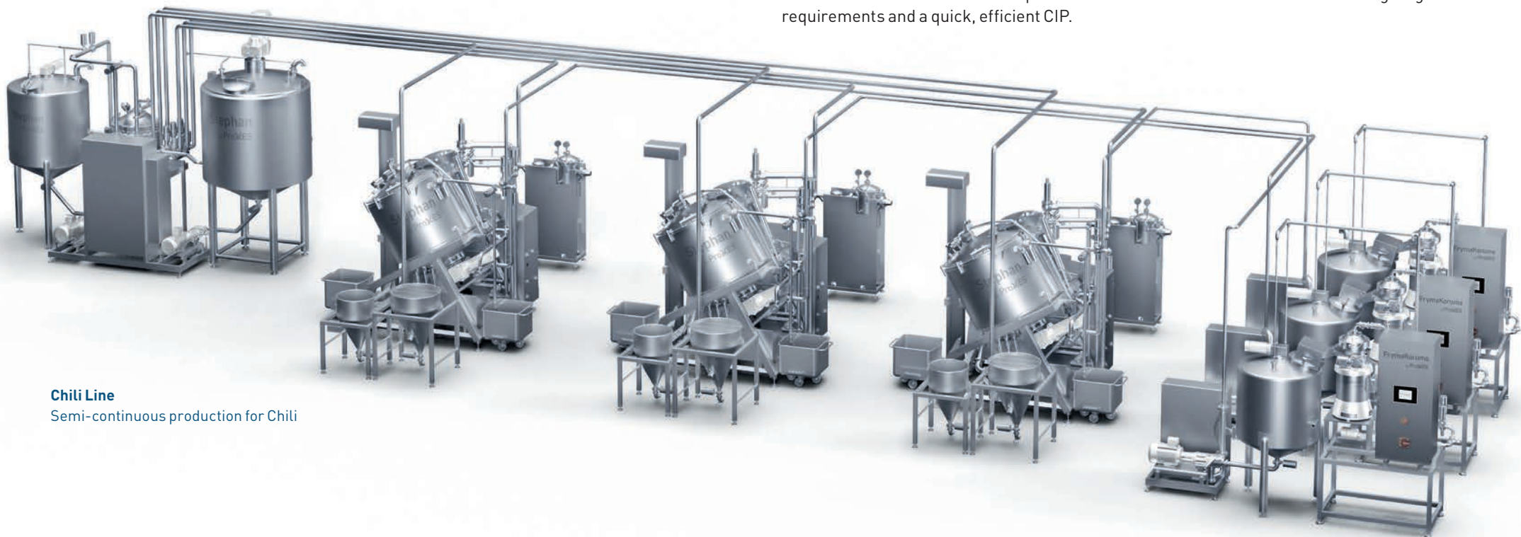
Chili Line Semi-continuous production for Chili

ProXES bespoke engineered systems help you significantly scale up your production process. High throughput, uniform quality and a reduced cost per unit as compared to the batch process are important advantages for manufacturers who want to go big.