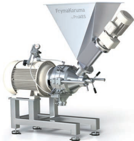
MZ 250 Variable wet milling

HEATING COOLING HOMOGENISING DEAERATION VACUUM GRINDING CUTTING MIXING