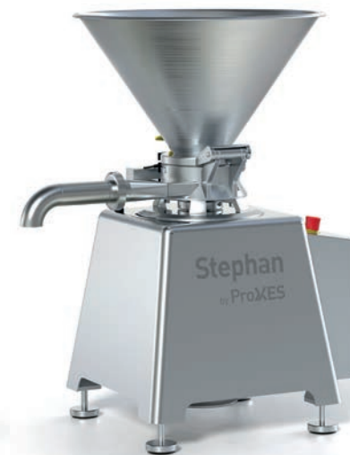
MC 15 Perfect for fine cutting and emulsifying