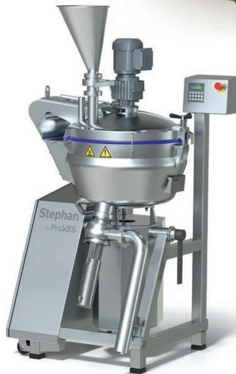
UM74 Perfect for small & medium batches