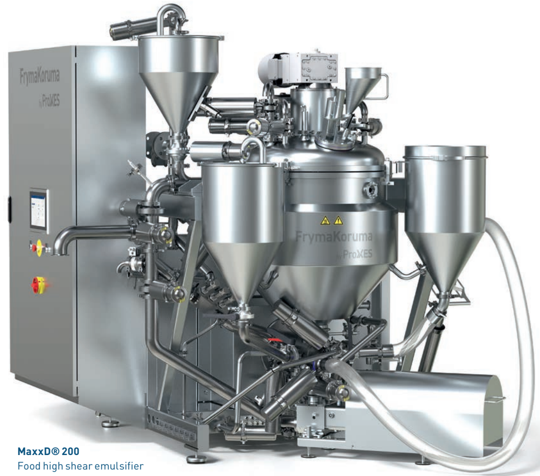
MaxxD® 200 Food high shear emulsifier