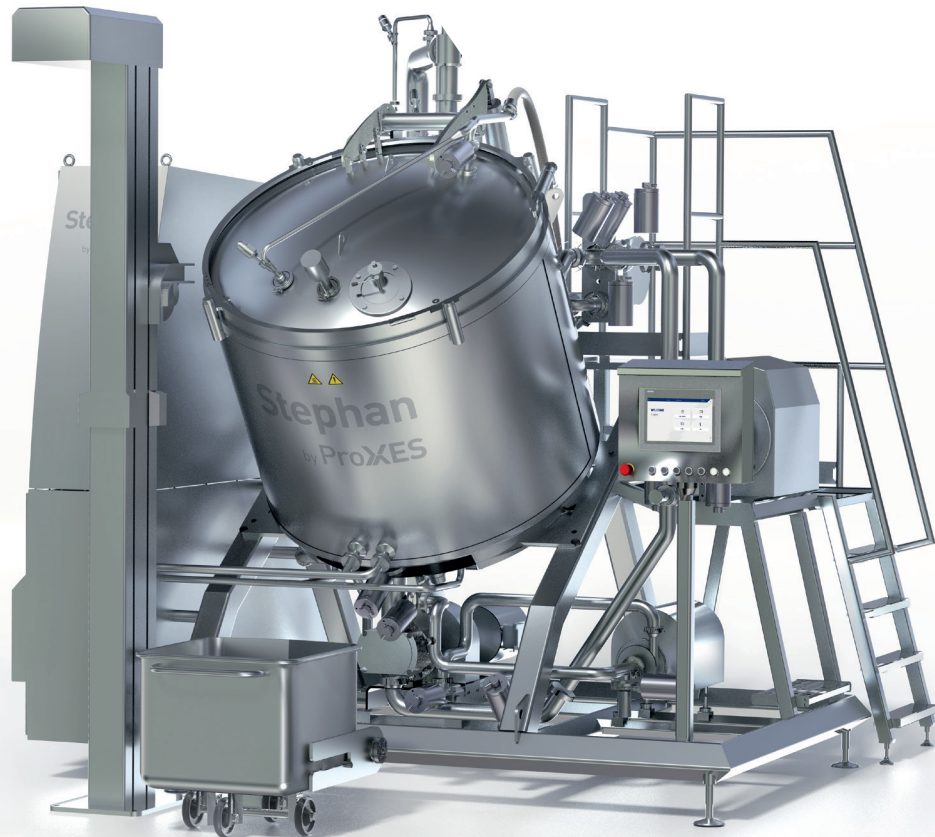
Vacutherm Efficient hot & cold processing