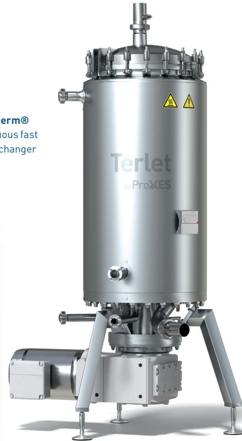
Terlotherm® Continuous fast heat exchanger

Whether you aim at large ketchup production volumes or smaller specialised batches – ProXES can help.